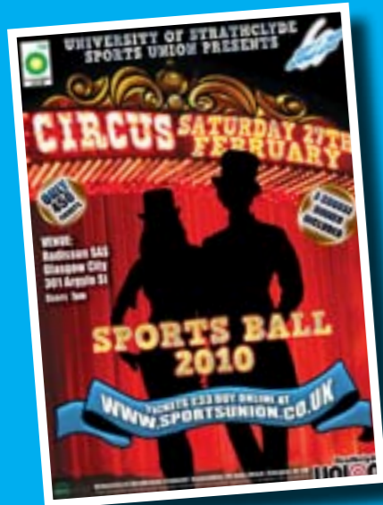
Night to Remember: Sports Ball 2010 Saturday 27th February Raddison Hotel